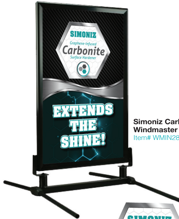
Simoniz Carbonite™ Windmaster Insert - 28"x44" Item# WMIN2844CARBON