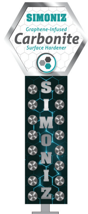
Simoniz Carbonite™ "Lollipop" Sign Item# CARBONLOLLIPOP CARBONLOLLIPEP