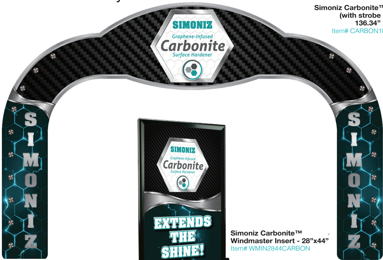
Simoniz Carbonite™ Arch (with strobe lights) 136.34" x 168" Item# CARBON1MCWW