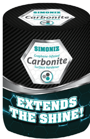
Simoniz Carbonite™ 55 Gallon Drum Cover Item# DC55CARBONITE