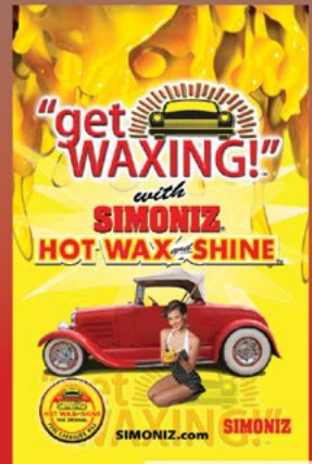
SIMONIZ HOT WAX & SHINE WINDMASTER SIGN WACS21

"The concept is simple. Simoniz Hot Wax and Shine is a credible service that produces eye popping results. We suggest you position it by offering it in a brand new Top Package. Many operators are reporting an overall increase of $1.50/car by creating a new Hot Wax and Shine Top Package... because it does what the name implies."