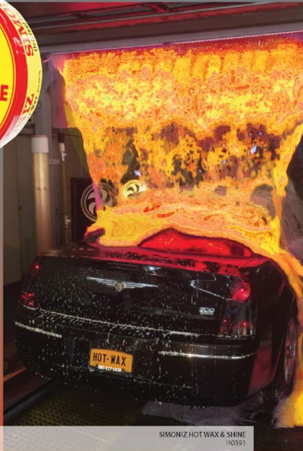
SIMONIZ HOT WAX & SHINE H0391