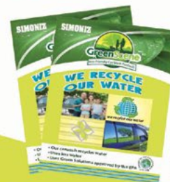
Greene Scene Car Wash Handout Item # Literature #45