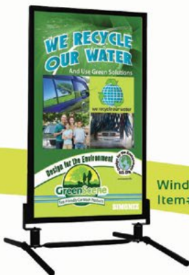
Windmaster Frame Item # MARI005BK

Blue (G1413), Pink (G1414), Yellow (G1415), White (G1416) Low pH foam polish, works great through compressed air foamers or foam guns. Beads up and rinses freely. Non-fluorescent dyes rapidly break down in pit. Apply through Triple Foam applicators to the vehicle at a final dilution rate of 80-120/1.