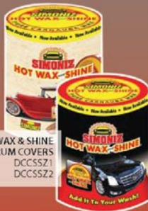
SIMONIZ HOT WAX & SHINE DRUM COVERS DCCSSZ1 DCCSSZ2