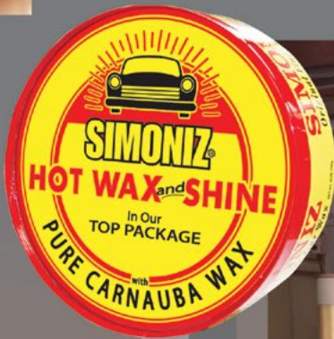
SIMONIZ HOT WAX & SHINE ILLUMINATED SIGN TSSLUMR-1 SIGN PEDESTAL TSSPED62