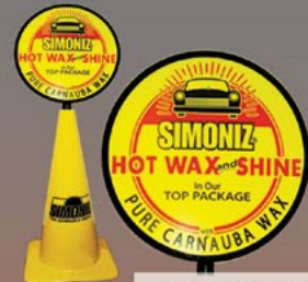
SIMONIZ HOT WAX & SHINE TRAFFIC CONE TOPPER TSS5MN1