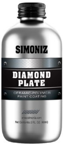
Item # DPKIT-6 (6 viles/case)