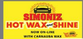
SIMONIZ HOT WAX & SHINE BANNER ABHOTWAX-1