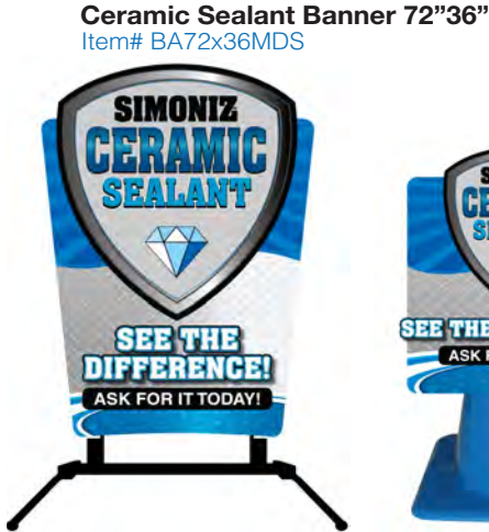
Ceramic Sealant Antenna Sign

Item# DC30 - 30 gallon drum DC55 - 55 gallon drum