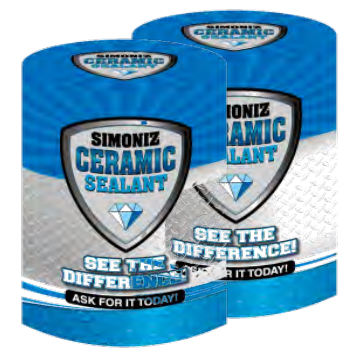
2 drum covers

CERAMIC1 Package includes a dosatron pump station for easy dilution control, delivery and consistency.