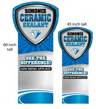
Ceramic Sealant Tunnel Fixtures 60" and 45" Great for IBA's

9ft Tear Drop w/Mounting 2 sided 11.2ft Tear Drop w/Mounting 2 sided FG112 13.5ft Tear Drop w/Mounting 2 sided FG135