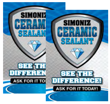
2 Windmaster inserts