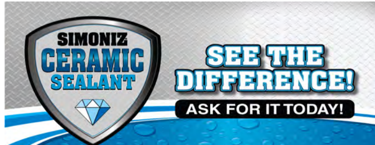
Ceramic Sealant Banner 96"36" Item# BA96x36