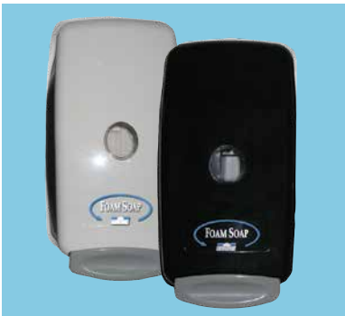
FOAM SOAP DISPENSER