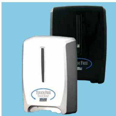
TOUCH FREE FOAM DISPENSER

Item #'s DAA501501 - Black DAA501401 - White