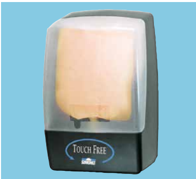
TOUCH FREE LOTION DISPENSER