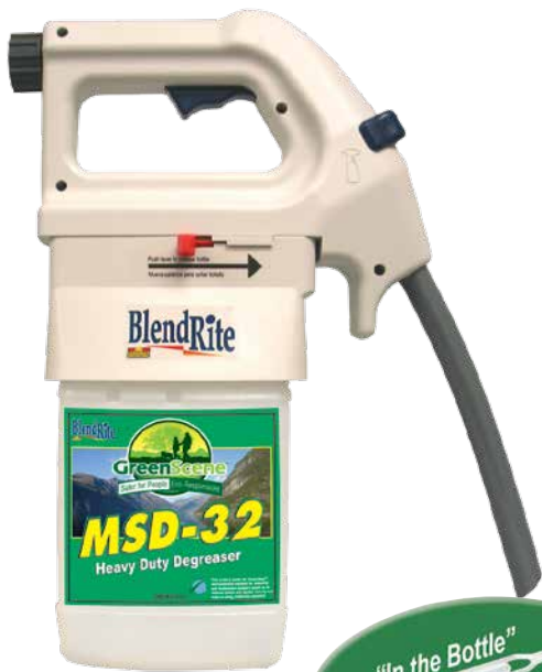
Blend Rite™ Portable Dispensing Unit SP6597