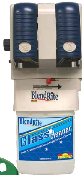
Blend Rite™ Wall Mount Dispensing Unit SP6596