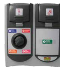
WALL MOUNT UNIT