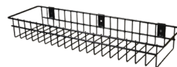
5 PRODUCT RACK