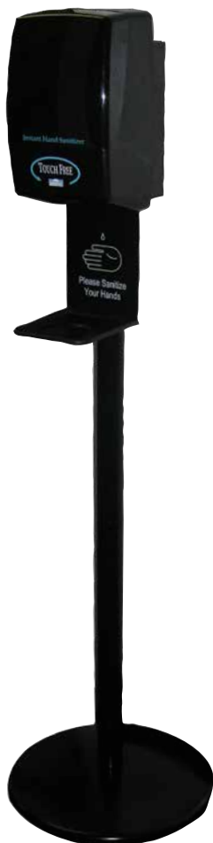
FREE STANDING TOUCH-FREE HAND SOAP/SANITIZER STAND | UCFAS1401