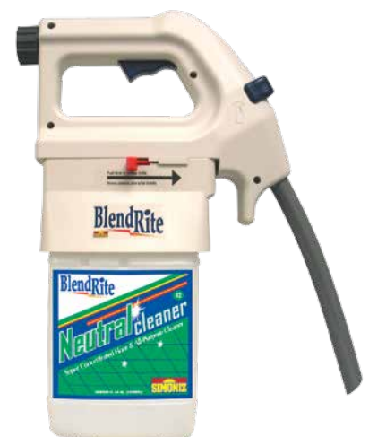
BLEND RITE PORTABLE DISPENSING UNIT | SP6597