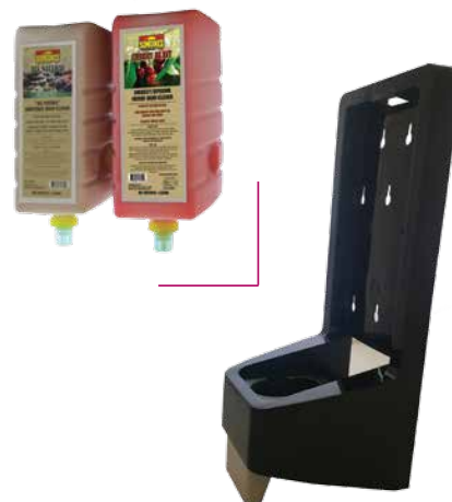
WATERLESS SOAP DISPENSER | 49700-1