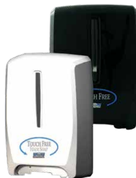
TOUCH-FREE FOAM DISPENSER White | DTFFW Black | DTFFB