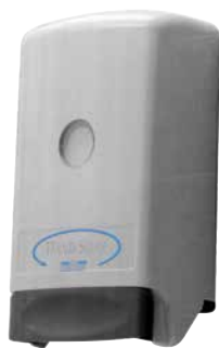
BAG-IN-BOX DISPENSER | DAADISP#1

"The hand soap/sanitizer stand is great for waiting areas, lobbies, workplace and retail environments!"