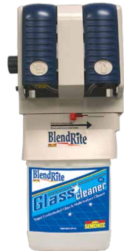
BLEND RITE WALL MOUNT DISPENSING UNIT | SP6596