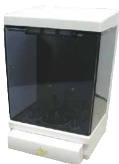
BULK DISPENSER | IMP3311