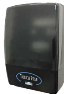
TOUCH-FREE LOTION DISPENSER Black | UC2001A

"The hand soap/sanitizer stand is great for waiting areas, lobbies, workplace and retail environments!"