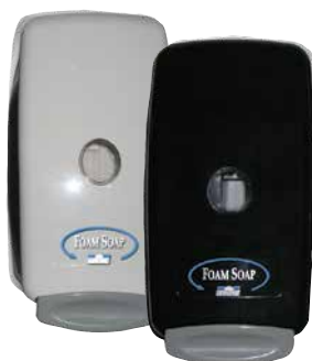
FOAM SOAP DISPENSER White | DAA501401 Black | DAA501501